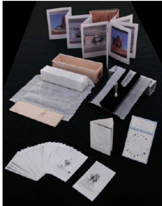
The World and Its Inhabitants, Aqua Abris and Power of Place

The artist book belongs to a special category. They are made by people who are artists in another medium, and who bring those skills and sensibilities to the construction of creative volumes. Most are hand made in very limited editions. Some are one of a kind. Most have larger runs, but in the spirit of printmaking editions, are still well under the number of copies of a typical commercial press run. Some artist books are simply books made by artists. But the majority are works of art. As such, the book is simply another medium to experiment with. Artist books regularly challenge bookish conventions. They usually emphasize a volume's tactility, its sensuous body. Artists use alternative materials; unpaginate or unbind; and manipulate formal, physical elements to echo or disrupt the text and its content. Artist books make us aware of the medium; make the medium the message, not just the messenger.